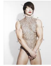
photo paper, marker, gouache, razor etching 17 x 11 inches

Maxing Out in Opera Pink, Version 1 , 2013